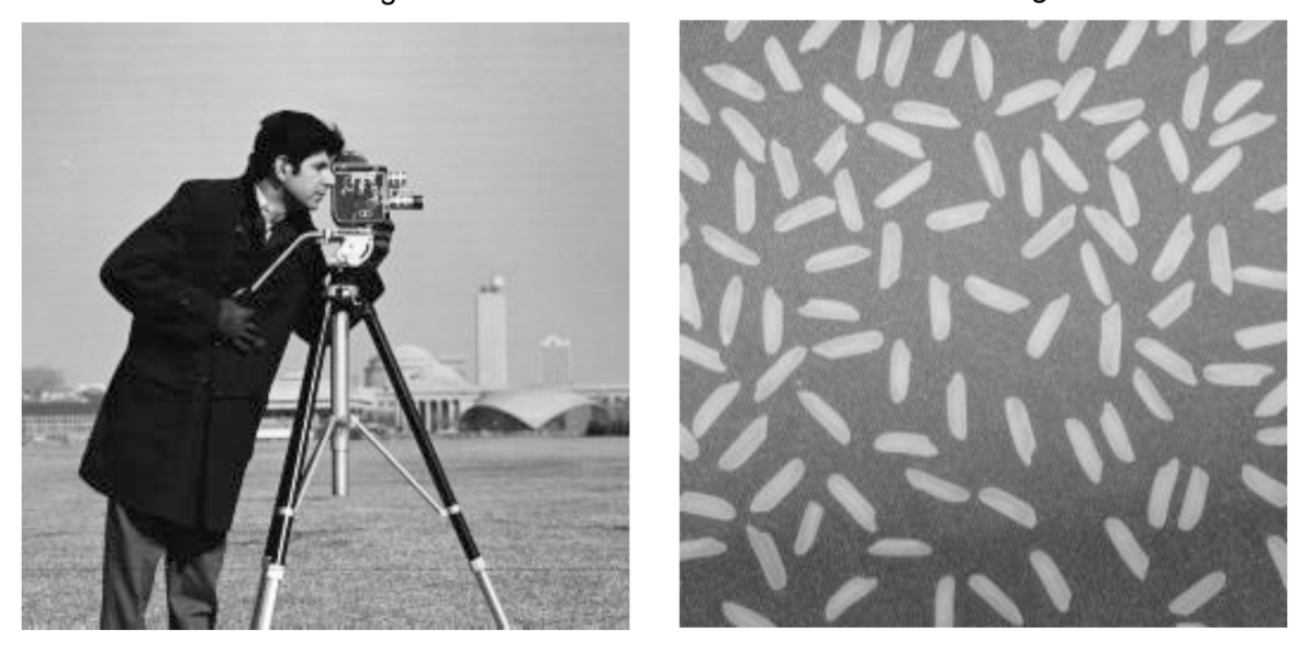
FIGURE 3. (a) Secrete image, (b) Cover image.

converted into the original form of data (text, image, etc).