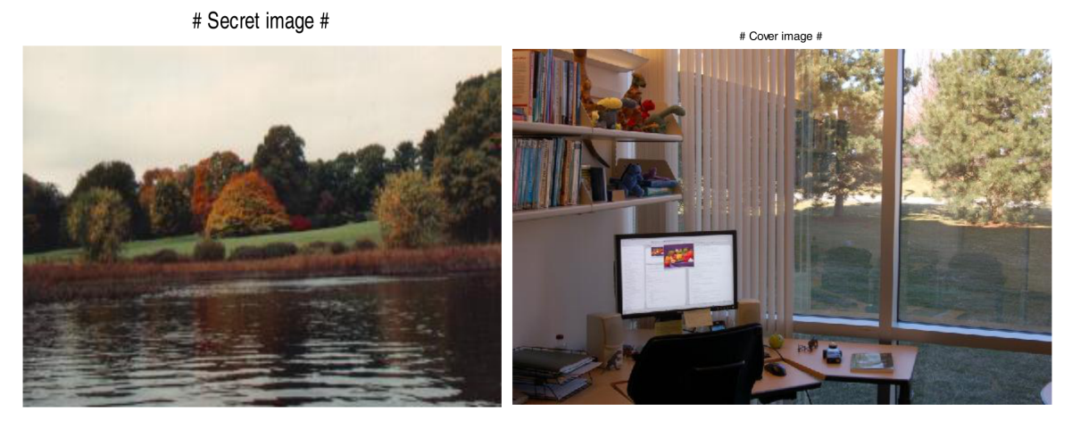
FIGURE 5. (a) Secrete image, (b) Cover image.

TABLE 3. Results of Rice cover image and the text secret message.