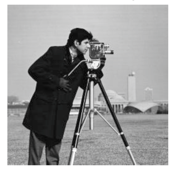
FIGURE 4. The reconstructed secret image cameraman (256 \times 256).

As listed in this table, for a similar size, 1:1, the optimal length of the secret message frame is 3 bits with a percentage of the secret message to key length of 1.33. For a high capacity of 1:600 times, the optimal SMF is 7 for the same ratio of the key to secret message length of 1.3. It is worth to mention that, for all data, the similarity of the secret message is completely available in the cover image data. Furthermore, the NC for the reconstructed secret image is 1, which means there is no data loss in the proposed model. Fig. 4 shows the reconstructed secret image.