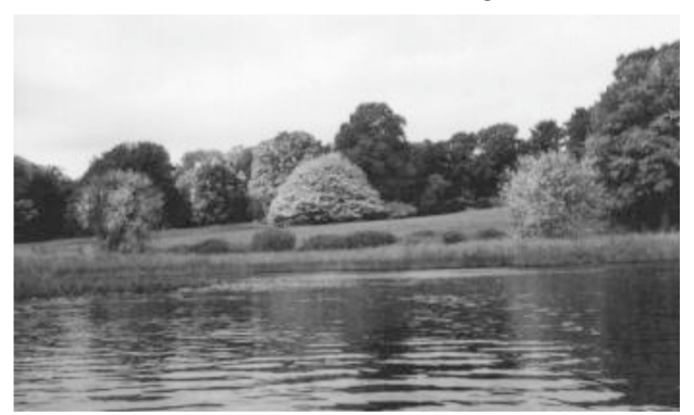
FIGURE 6. The reconstructed secret image autumn (345 \times 206) .